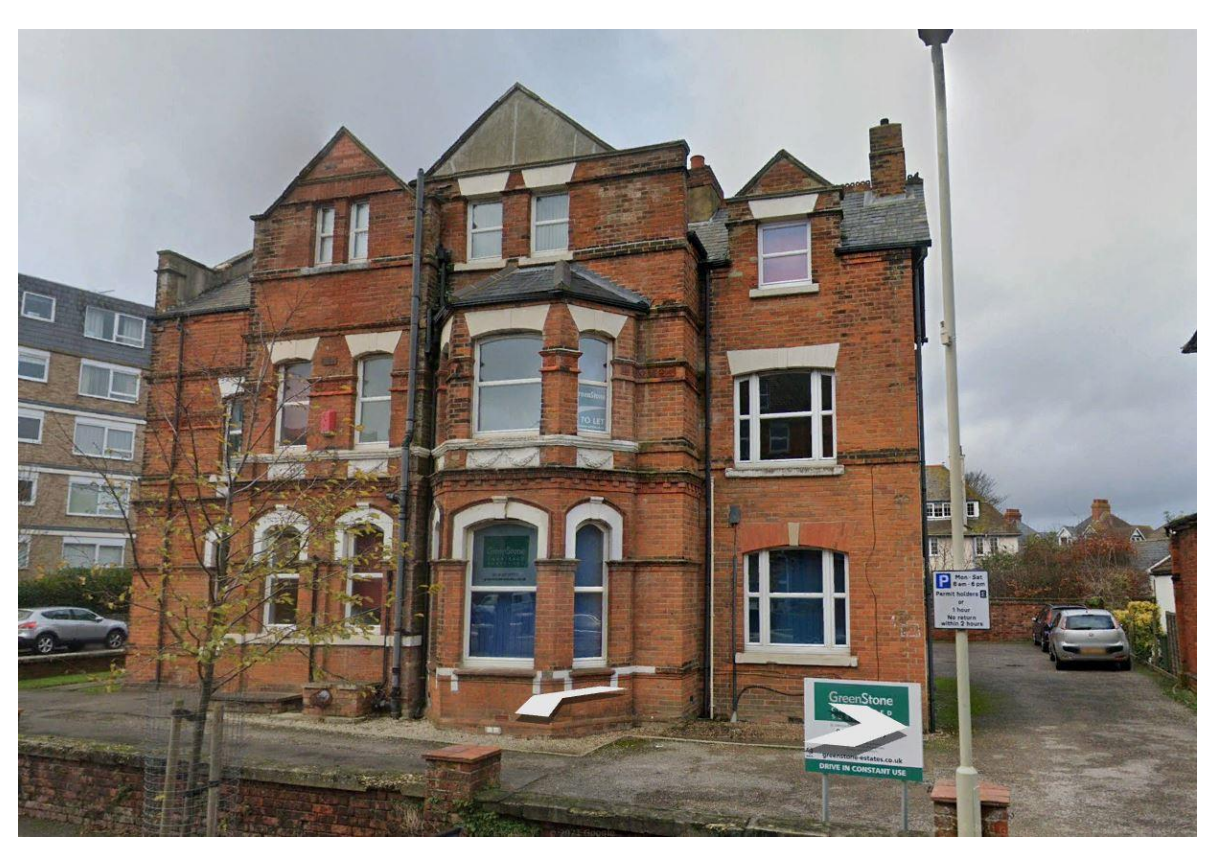
Plate 3. The site (looking NE- Google Earth/Street View)