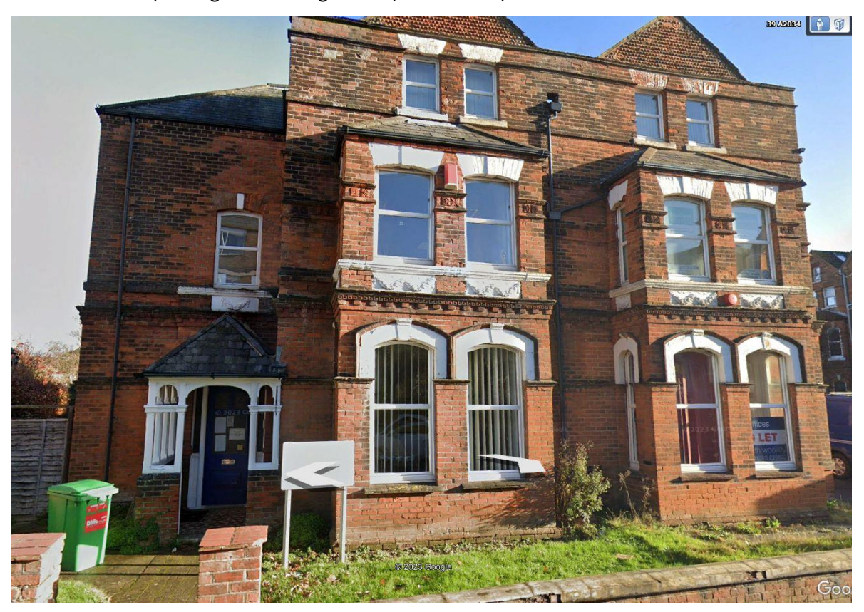
Plate 2. The site (looking NNW- Google Earth/Street View)