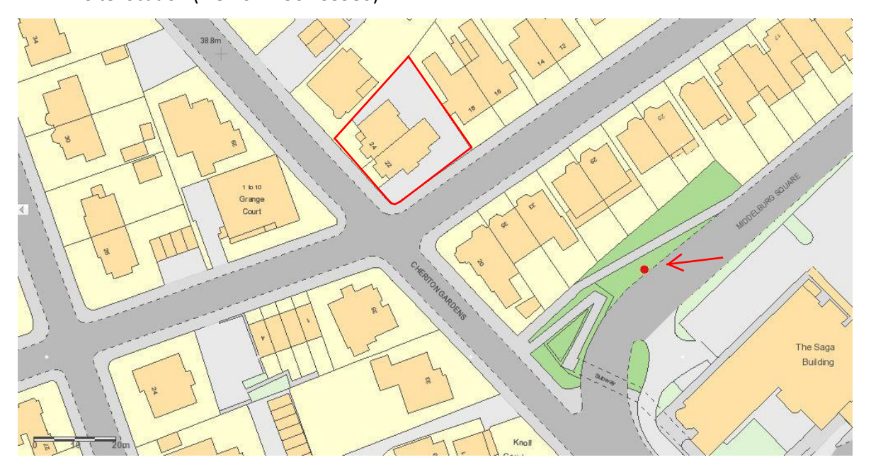
MAP 2. KCCHER map shows PDA and Heritage Asset of Gospel Hall (Red dot)