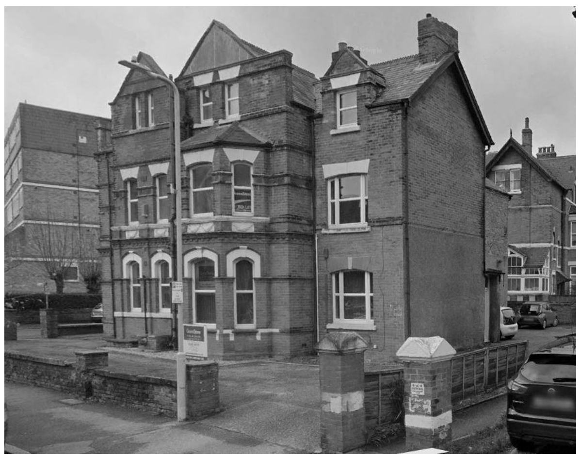
22-24 Cheriton Gardens, Folkestone, Kent, CT20 2AS: Heritage Statement