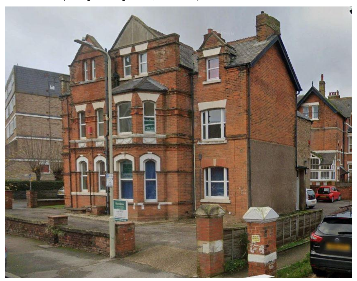
Plate 4. The site (looking NNE)