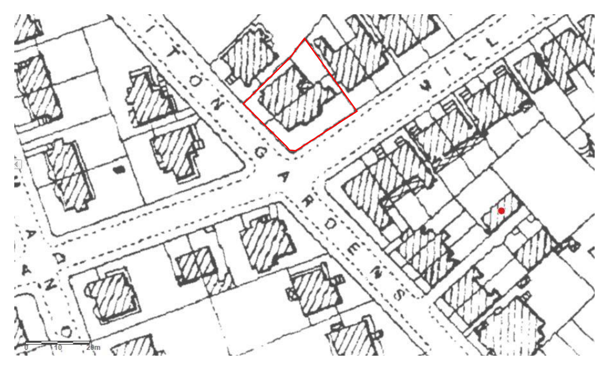
MAP 3. OS Historic mapping c.1900